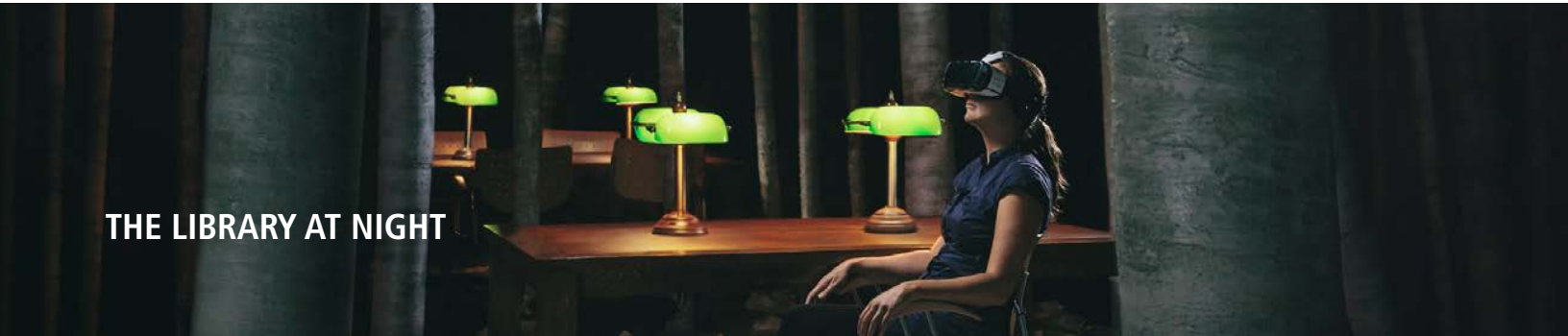
THE LIBRARY AT NIGHT

Known for his high tech productions in opera, theatre, circus and large scale projections, Robert Lepage prefaces his comments by insisting he knows nothing about how technology works. This, he says, is fine as it allows for a more poetic point of view. “Artistically, I don’t get involved in the technical aspects ... it’s another language and I trust the people who do it, and they do it well.” For the next hour, as he expands upon the intersection of art and technology, it becomes very clear that what makes his work so powerful is that technology is in the service of art. So much so, that it has to race to catch up with the artistic vision.